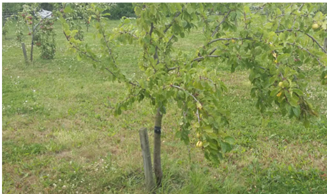
Warwickshire Drooper Plums

We have taken the first harvest of honey from our new hives - only a small amount but delicious! It seems like the bees are happy so long may they remain at the orchard.